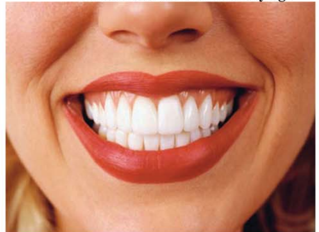
A great smile builds confidence