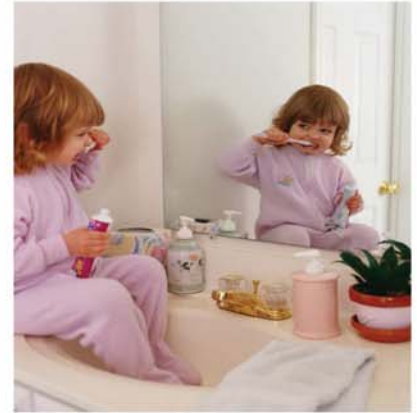
Dental care starts at an early age

Your President and Executive Board are always working on your behalf to increase your benefits. Your union urges you to not only take advantage of our recommended dental offices but to tell all of your co-workers to take advantage of the benefits we offer to union members such as the coupons attached below. For 25 years the Union Dental network of dentists has cared for the dental needs of union members such as CWA, IBEW, AFA, UA and UTA and is now available to all AFL-CIO members. The doctors in each office are members of the NFOPAPE. Support the dentists who are supporting you. Make an appointment with your local Union Dental provider to show the strength of SOLIDARITY.